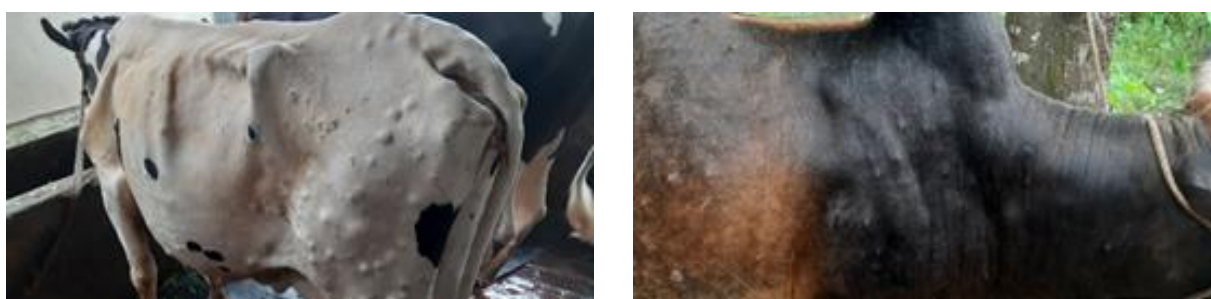
Figure 1: Characteristic skin nodules (disseminated cutaneous papules with necrotic centers) in LSD affected cattle

In a postmortem examination, pox lesions can be found throughout the entire digestive and upper respiratory tracts and lungs, and on the surface of almost any internal organ.